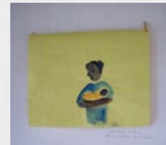
Sometimes i feel like a mother and child